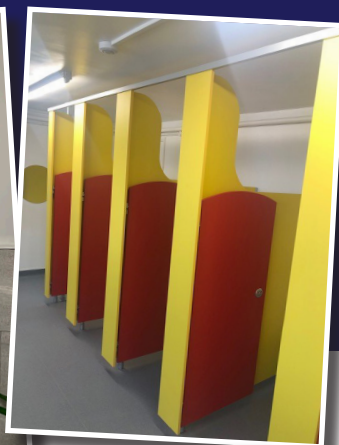
Pupil and staff toilets at Lawnside Academy have both been refurbished through SCA money